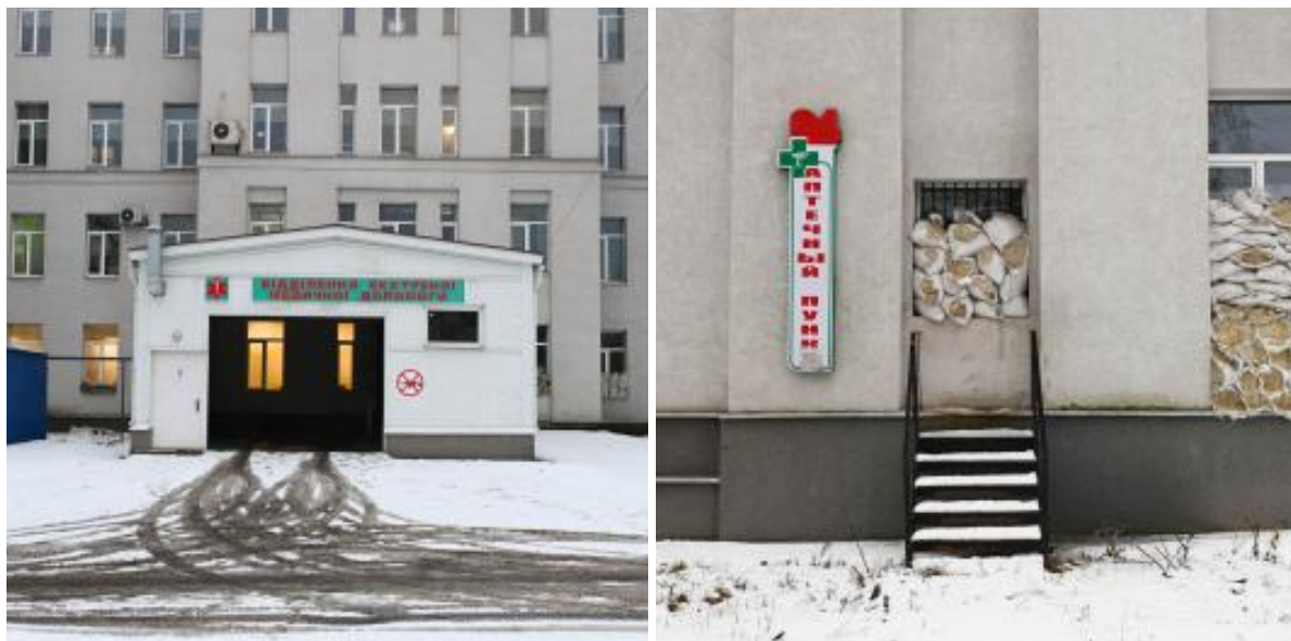
Kostyantynivka hospital, Donetsk region, Ukraine.

The difficulties of obtaining medicines and accessing medical care is further corroborated by messages sent by mobile phone between MSF medical teams and Ukrainian doctors and nurses working in Russian-occupied areas of Kherson and Zaporizhzhia regions who made repeated requests to be supplied with essential medicines.