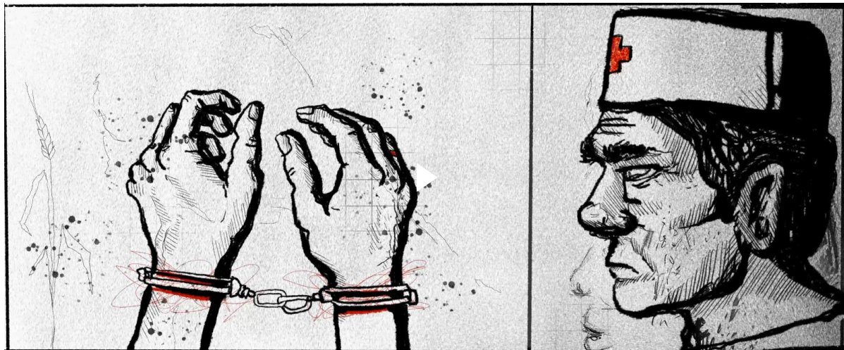
Medical doctor, Mykolaiv region.

Furthermore, medical practitioners who previously lived in areas occupied by Russian forces described to MSF teams the treatment they received at the hands of soldiers, which included intimidation, detention, violence and ill-treatment. One doctor working in a facility currently supported by MSF described his experiences: