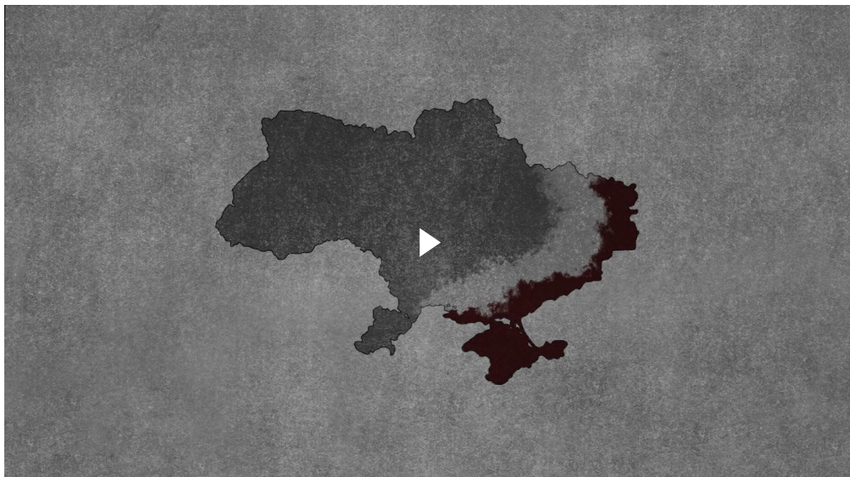
Destroyed health facilities witnessed by MSF in Ukraine re-taken areas. October-December 2022.

Since the escalation of the war in February 2022, MSF has scaled up its humanitarian activities in Ukraine, with an emphasis on support for people living near the frontline, where the humanitarian and medical needs are most acute. This support has taken the form of surgical and emergency room care, evacuating patients to medical facilities further from the frontline, providing essential medicines and medical equipment, establishing mobile medical clinics, and providing physiotherapy and mental healthcare.