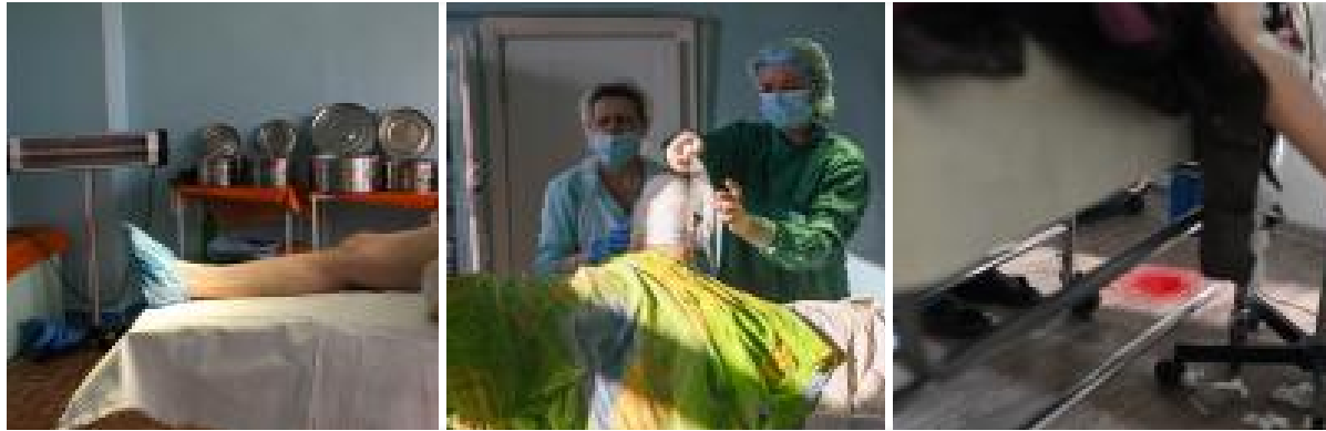
Kostyantynivka hospital, Donetsk region, Ukraine.

seeing their villages turned into battlegrounds, relentless shelling and the disappearance and death of family members.